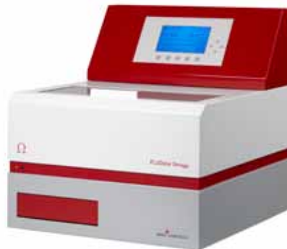
Fig. 1: BMG LABTECH's FLUOstar Omega with Atmospheric Control Unit (ACU)

All Campylobacter cultures were grown in Mueller Hinton broth (MHB) or on Mueller Hinton agar (MHA) plates (Oxoid). Antibiotics were added at these final concentrations: vancomycin, 10 µg/mL; trimethoprim, 5 µg/mL. Bacterial cultures were grown in sterile Corning 15 mL polypropylene tubes.